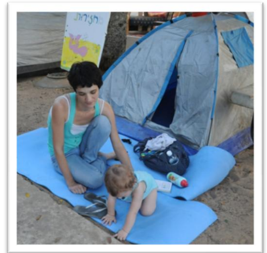
Mother, Child & Tent

Ma Tovv - As I write these lines to you, Ma Tovv , the well-known song from the opening of the morning prayers, is being sung by the young of our Nation - " How fair are your tents, O Jacob, your dwellings, Israel! " (Numbers 24:5) These words definitely reflect the extraordinary spirit on this Eve of Rosh HaShanah, in which a new chapter is being written in the history of this country. The many thousands of Israelis who chose to spend the summer heat in tents throughout the country express a grassroots call to reshuffle the national agenda, making sure no one is left behind. Or as Amos Oz put it, what they are really saying first and foremost is: "We are all brethren."