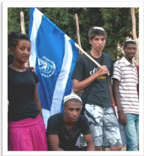
Yemin Orde Young Leadership at the rally: "We are all brethren!"

For our kids, no strangers to the feeling of being left behind, being with the protesters was a startling eye opener on many levels. Suddenly, they realized how connected they are to the spirit of the young generation outside the Village, those who carry the burden of Israel's economy and defense on their shoulders. You, our children's friends, really ought to see the events unfolding here through their eyes, and I will try my best to share their insights with you.